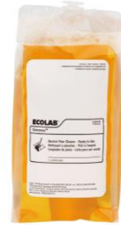
Neutral Floor Cleaner 1 Liter Bag