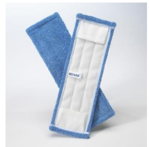
Washable Microfiber-blend Mop Pads