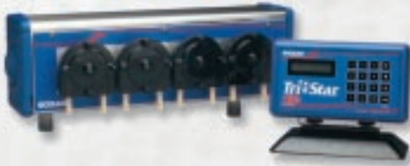
The Tri-Star® control panel is programmable for up to 16 wash classifications.

As a part of the 360° of Protection™ program, whatever your laundry challenge, Tri-Star® has the product solutions to meet your specific needs and keep your entire facility clean and completely protected.